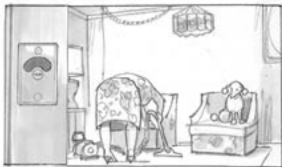
Imodium 2. "Grooming" (cont'd)