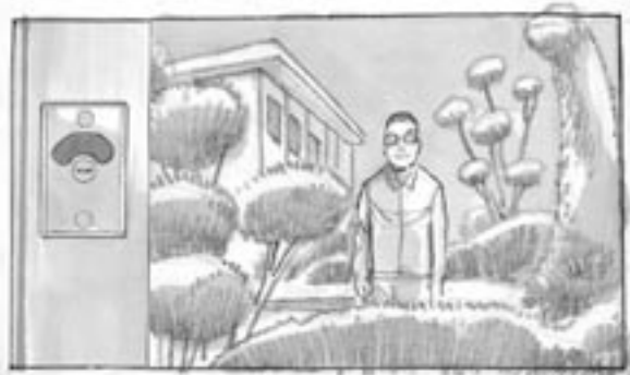
Imodium "Topiary" (cont'd)