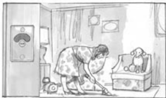
Imodium 2. "Grooming" (cont'd)